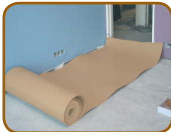
1. Unroll InsulParq wall to wall, leaving a surplus running up each wall

Laying the roll : The floor should be smooth and carefully brushed. Unroll InsulParq from one side of the room to the other, leaving a surplus at each end running slightly up each wall. Apply the supplied aluminium tape to the joints. Lay the parquet flooring and, only after this has been done, trim the surplus InsulParq. Attach the skirting board to the wall, slightly higher than the flexible flooring, so that the two do not touch. Seal the gap between the skirting board and the flooring with a silicone sealant.