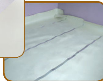
2. Apply the aluminium tape to the joints

Advantage: the aluminium tape included with each roll of InsulParq makes the underlay completely impenetrable and thus protects the parquet flooring from humidity