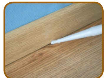
5. Attach the skirting board a few millimetres above the parquet flooring, then fill the gap with sealant