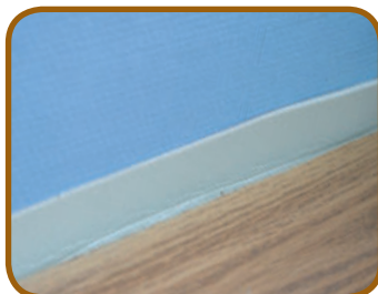
3. Place the parquet flooring, leaving the surplus underlay