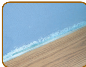
4. Trim the surplus InsulParq